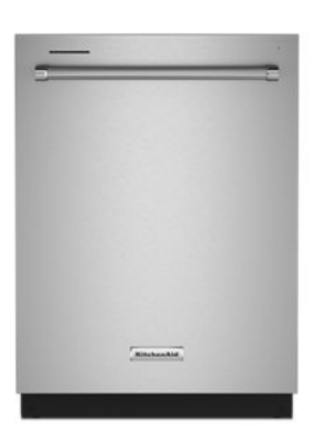
SUITE MATCH DISHWASHER KDTM404K