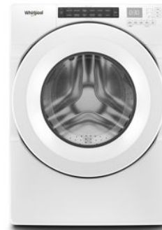
LAUNDRY / PAIR WITH WFW560CH