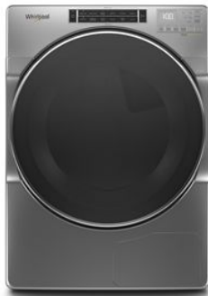
ALSO AVAILABLE / STEP UP WHD862CH

Be sure to tune into your customers' shopping priorities to bundle products across categories