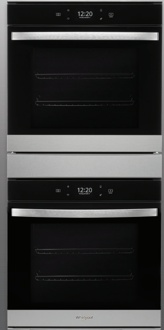
Available in Double Oven WOD52ES4M Z/B/W 5.8 Cu. Ft.

Tackle to-do lists with smart features built for multitasking.