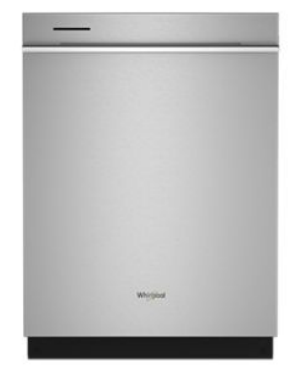
SUITE MATCH DISHWASHER WDTS7024R