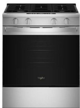
ALSO AVAILABLE / STEP UP WSGS4530T

Be sure to tune into your customers' shopping priorities to bundle products across categories