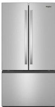
SUITE MATCH REFRIGERATOR WRFF3336S