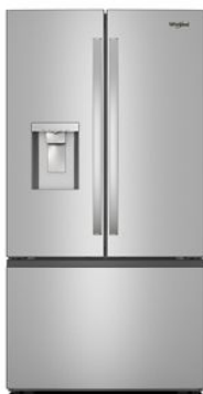
SUITE MATCH REFRIGERATOR WRFF3536S