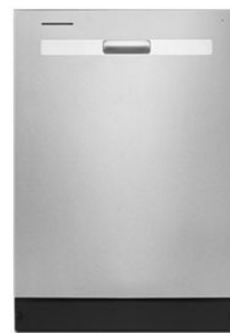
SUITE MATCH DISHWASHER WDP540HAM