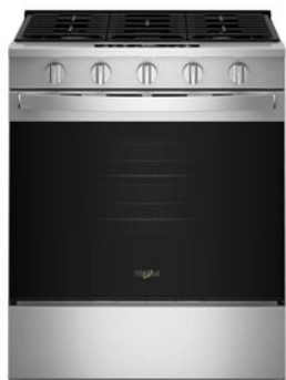
ALSO AVAILABLE / STEP UP WSGS5030S

Be sure to tune into your customers' shopping priorities to bundle products across categories